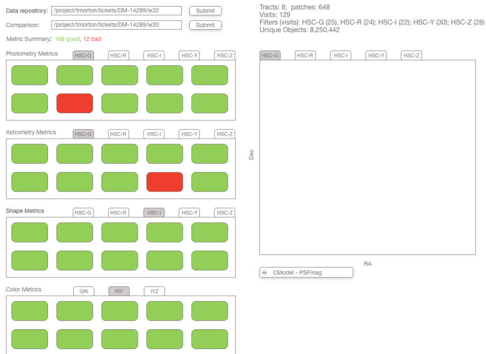
FIGURE 1: Mock-up of the “quick look” overview screen of the drill-down system. This provides a summary of all metrics calculated over the results of a particular pipeline execution, indicating any that fell below threshold.